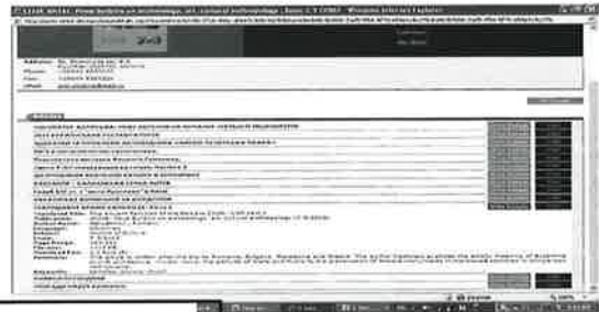
Fig. 2. Full text of article