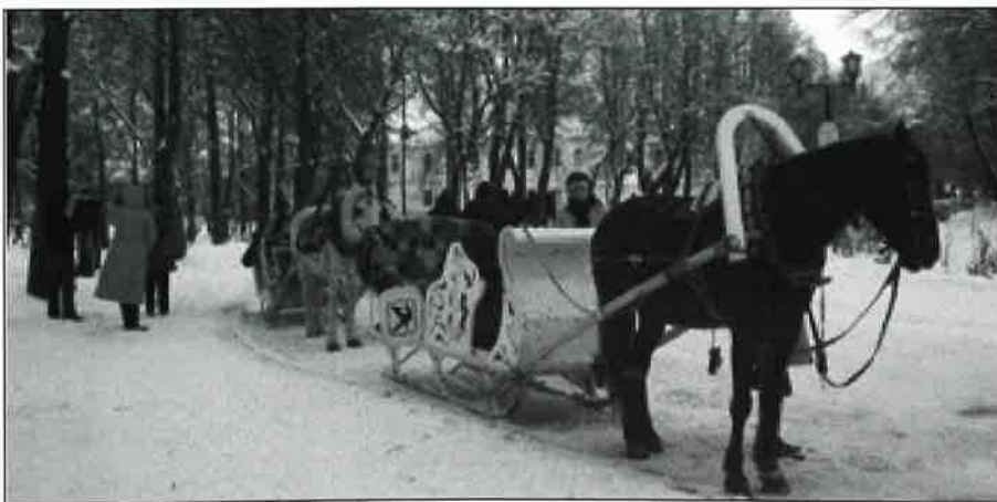
OSP students in Suzdal

In autumn of 2006, nineteen Stanford students from a variety of disciplines including Russian Language and Literature, Political Science, Economics, and even Computer Science and Biology found themselves taking classes together at Stanford's Overseas Campus in Moscow. Students studied at Moscow's Academy of National Economy Under the Russian Federation, taking courses in Russian history, politics, economic policy, and literature from preeminent Russian scholars and senior government officials.