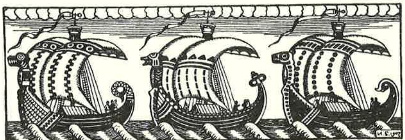
66 Head-piece for the Novgorod bylina of Sadko the Wealthy Merchant. 1907