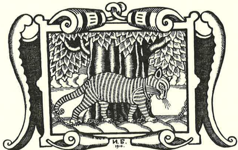
82 SIR CAT THE WISE Frontispiece for The Tale of the Golden Cockerel by Pushkin. 1910